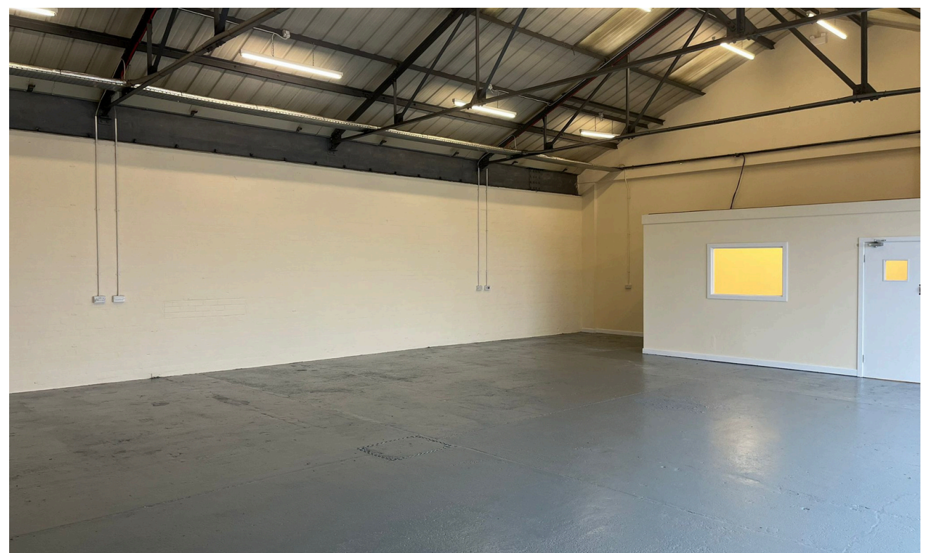
WAREHOUSE AND OFFICE

ETON BUSINESS PARK ETON HILL ROAD RADCLIFFE M26 2ZS